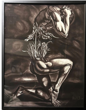
Ron White Stress Summit Artspace